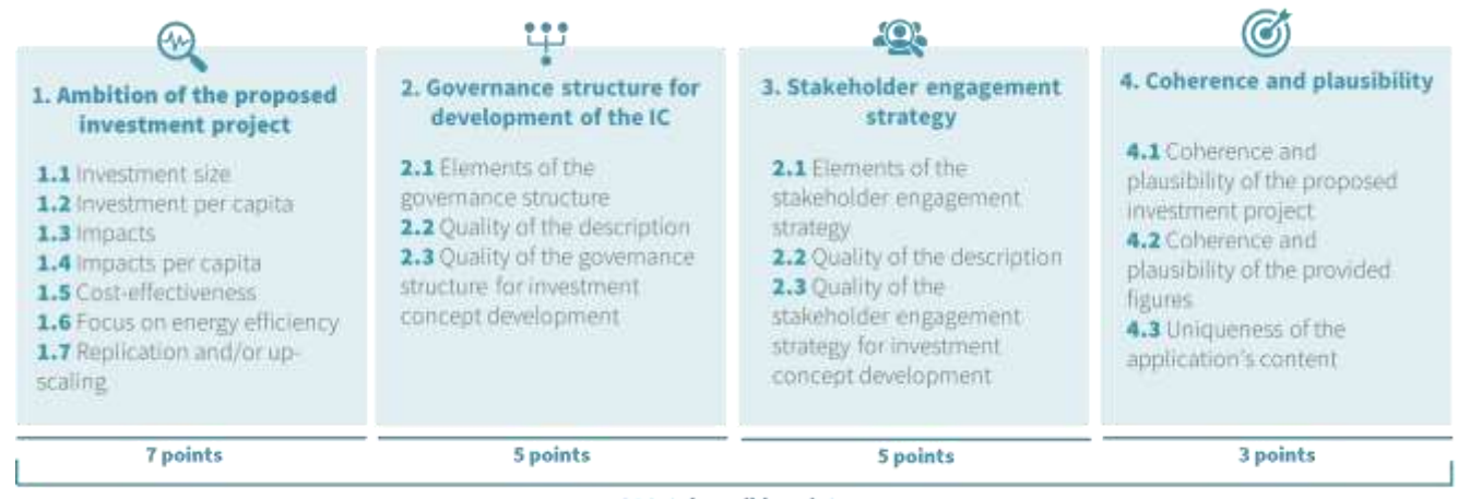
20 total possible points

The calculation of the evaluation score follows the logic presented in the graphic below: