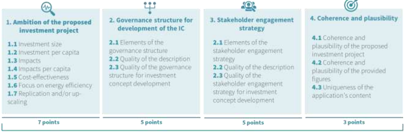
20 total possible points

The calculation of the evaluation score follows the logic presented in the graphic below: